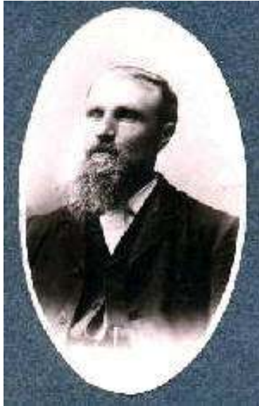
She was a native of Texas.